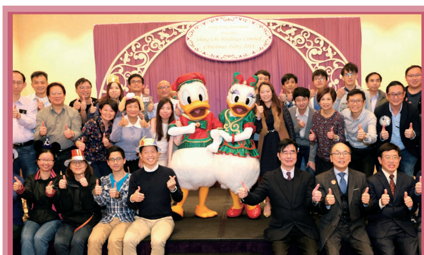
Christmas Dinner 2018 held at Disneyland

The Group also strives to establish harmonious labour relationships and create a happy working environment, promote a positive and healthy lifestyle, and lift the spirit of local workforce, encourage and strengthen internal communication through organising diversified employee activities, including but not limited to Christmas Dinner held at Disneyland, barbeque and golf event held at Pak Shek and joining the dinner symposium held by the Hong Kong Institution of Engineers.