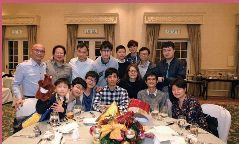
Christmas Dinner 2018 held at Disneyland

During the Reporting Period, the Group was not aware of any material non-compliance with relevant standards, rules and regulations regarding operations and activities, labour practices (2018: Nil).