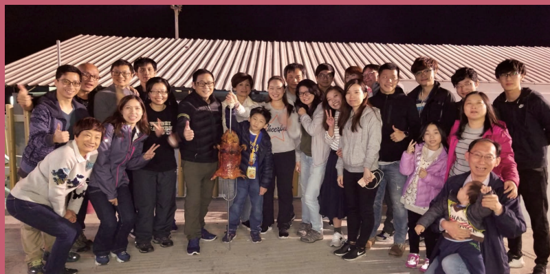
Barbeque event held at Pak Shek