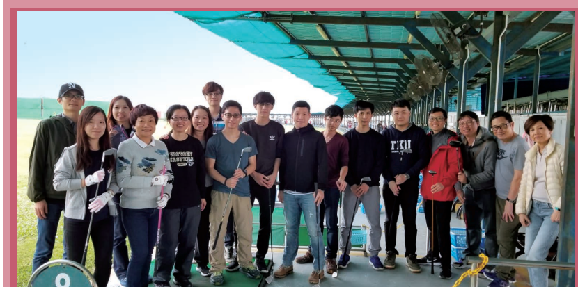
Golf event held at Pak Shek